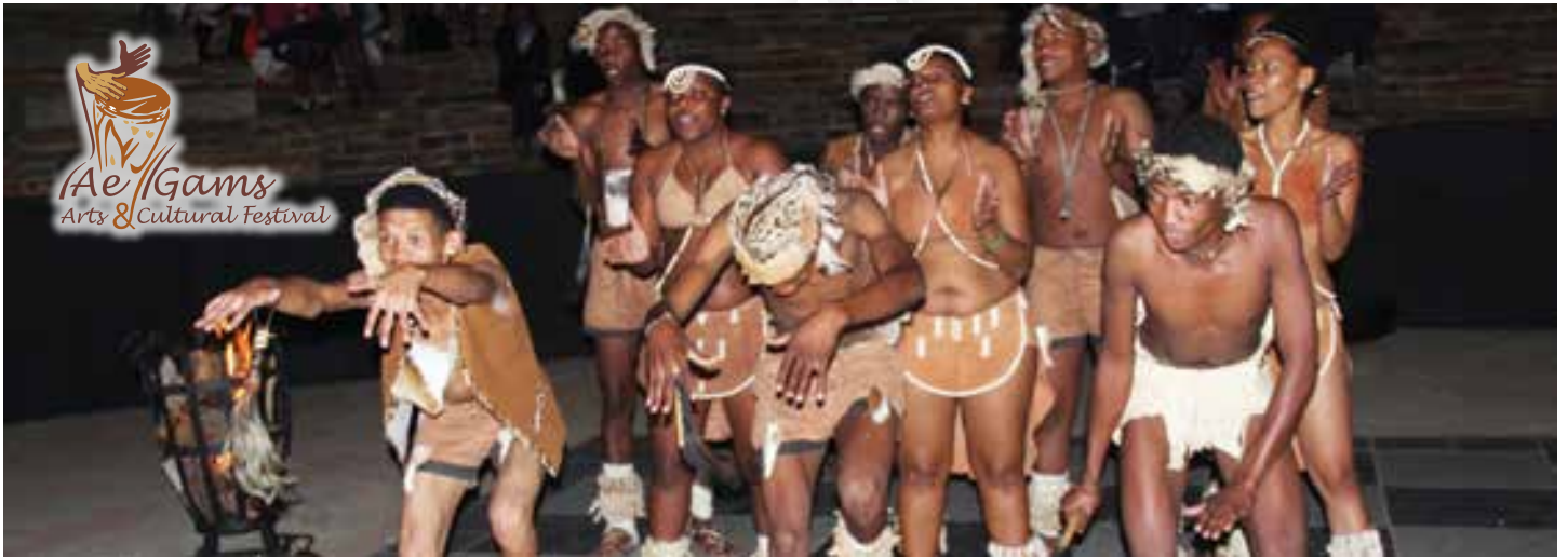
Black Melody Cultural Group

Windhoek being a beautiful modern African city, nestled between hills, is home to diverse cultures from all works of life. Despite the freezing weather experienced in Windhoek at the beginning of June 2015, it did not deter the organisers and participants of the well-known /Ae /Gams Arts and Cultural Festival from coming together in numbers to celebrate their diverse culture.