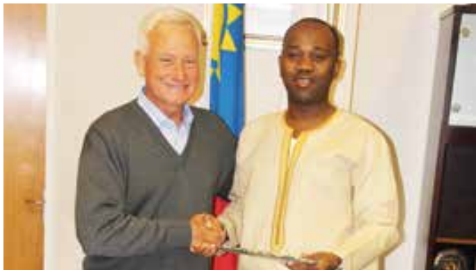
His Worship the Mayor of the City and County of Honolulu Mayor Kirk Caldwell and His Worship the Mayor of the City of Windhoek Cllr Mueseetse Kazapua

The Mayor of the City and County of Honolulu, Mr. Kirk Caldwell paid a courtesy visit to the City of Windhoek Mayor, Cllr Mueseetse Kazapua on Sunday 07 June 2015. The visit was the first of its kind by a Mayor from the county of Honolulu in the United State of America, and paved the way for future areas of corporation between the two cities. During the visit, Mayor Caldwell