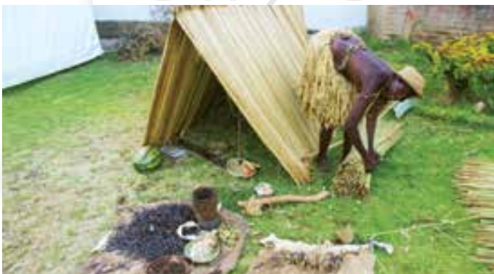
Maifwe Living Museum

The City of Windhoek initiated in 2001 the drive to promote Namibian cultural identities in order to enhance the drive for self-realisation and foster a common purpose of cultural diversity united under one vision, hence the /Ae//Gams Arts and Cultural Festival was born. To date, despite budgetary challenges, the festival maintains its objectives and continues to grow in strength and to draw audience from all parts of the city.