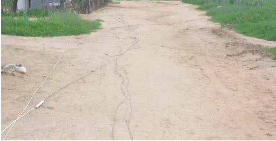
Illegal power connections in 8 th Laan, Windhoek

The City of Windhoek has recorded a number of unplanned power outages due to electricity tripping, especially in areas bordering the informal settlements, since the start of winter. There is always high demand for power consumption during winter, especially during peak hours (18:00 – 22:00) causing an overload in the network. These challenges are mostly experienced in the areas which are close to the informal settlements and the biggest contributing factor is the illegal connection which one can never plan for, when designing the systems.