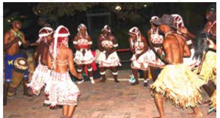
Djaupyu Siteketa Cultural Group